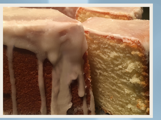
OUR BASE POUND CAKE IS MADE WITH AND GLAZED WITH LIMONCELLO. *GLAZE CONTAINS ALCOHOL.