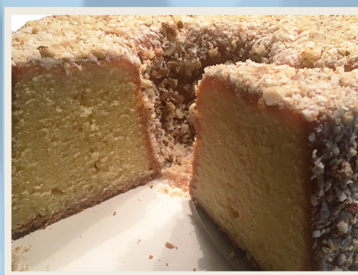
REAL ORANGE POUND CAKE MADE WITH PURE ORANGE OIL AND ORANGE PUREE. TOPPED WITH AN ORANGE GLAZE AND OUR SIGNATURE CRUMBS.