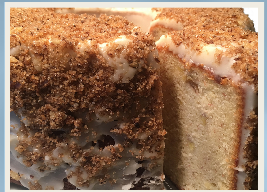
BANANA SOUR CREAM POUND CAKE MADE WITH REAL BANANA PUREE. TOPPED WITH A BANANA RUM FUDGE GLAZE.