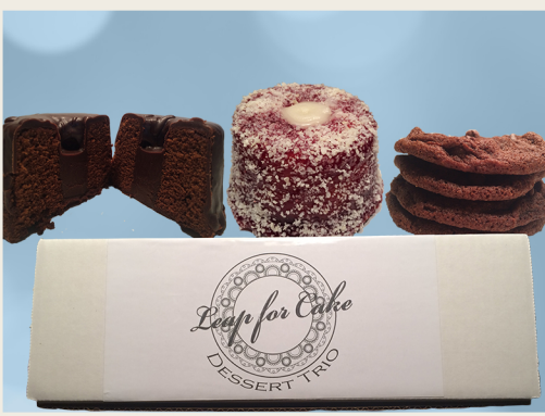
YOUR CHOICE OF ANY TWO MINI POUND CAKES FLAVORS AND 4 COOKIES OF ANY FLAVOR THAT FITS YOUR NEED.