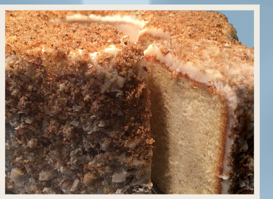
OUR BASE POUND CAKE MADE WITH REAL KEY LIME JUICE AND PURE KEY LIME OIL. TOPPED WITH OUR VANILLA-LIME FUDGE GLAZE.