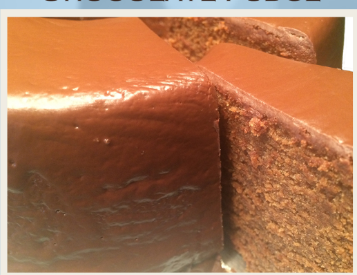
CHOCOLATE LOVERS! THE CAKE IS RICH WITH AN INTENSE CHOCOLATE FLAVOR ALL BY ITSELF. WE KICK UP THE CHOCOLATE FLAVOR UP EVEN MORE WITH A CHOCOLATE FUDGE GLAZE