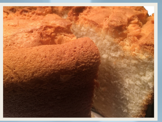
RICH, BUTTERY AND CREAMY POUND CAKE. THE ADDITION OF SOUR CREAM MAKES THE CAKE INCREDIBLY MOIST. EVERY BITE BOASTS OUR SIGNATURE FLAVOR COMBINATION