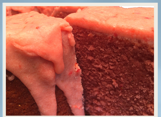
STRAWBERRY POUND CAKE MADE WITH AN ENTIRE POUND OF REAL STRAWBERRIES. IT IS THEN TOPPED WITH OUR STRAWBERRY FUDGE GLAZE.