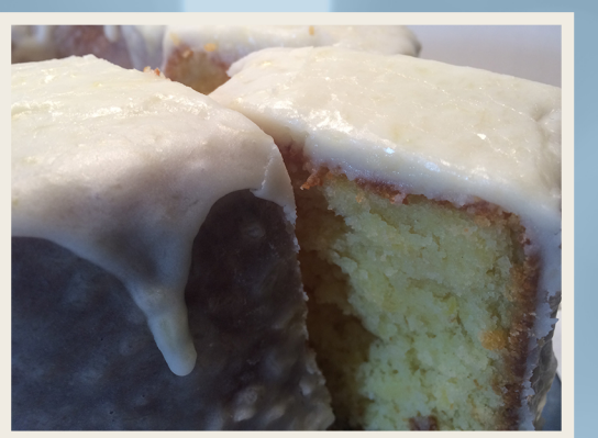
OUR BASE SOUR CREAM POUND CAKE MADE WITH REAL PINEAPPLE AND GLAZED WITH OUR SIGNATURE PINEAPPLE FUDGE.