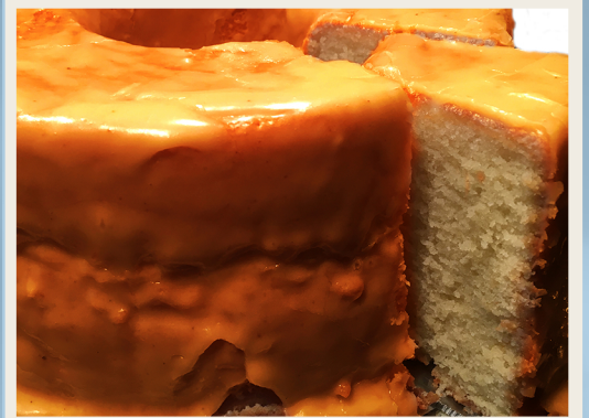
MADE WITH LOCAL HARD APPLE CIDER, A LITTLE SPICE AND CARAMEL APPLE GLAZE.