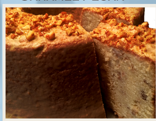
PECANS, CARAMEL, TOFFEE AND BROWN SUGAR ALL IN ONE CAKE! TOPPED WITH OUR SIGNATURE CARAMEL-PECAN FUDGE GLAZE.