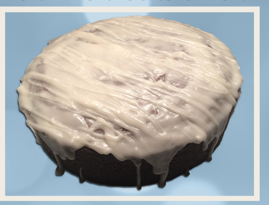
GINGER CAKE KICKED UP A NOTCH WITH BLACKSTRAP MOLASSES AND WARM SPICES! TOPPED WITH VANILLA FUDGE GLAZE