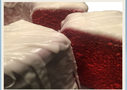
A TRUE CLASSIC MADE WITH A COMBINATION OF SOUR CREAM AND JUST A TOUCH OF CHOCOLATE. TOPPED WITH CREAM CHEESE GLAZE.