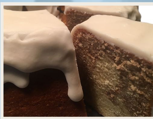
POPULAR HOLIDAY FLAVOR MADE WITH A SWIRL OF SPICED AND SOUR CREAM POUND CAKE BATTERS. TOPPED WITH OUR RUM FUDGE GLAZE.